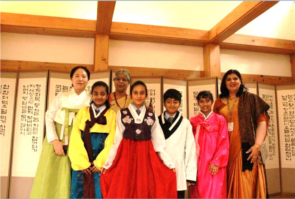
BVN students at the Korean Cultural Center